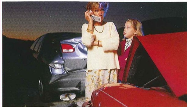
Please keep this in your vehicle's glove compartment.